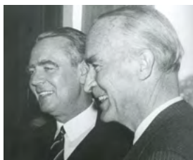
Alfried Krupp von Bohlen und Halbach (right) and Berthold Beitz

The Alfried Krupp von Bohlen und Halbach Foundation is the legacy of Dr.-Ing. E. h. Alfried Krupp von Bohlen und Halbach, the last personal proprietor of the Fried. Krupp company. In his will, he stipulated that all of his assets should pass into the possession of a charitable foundation after his death. This was made possible by a renunciation of inheritance by his only son Arndt von Bohlen und Halbach.